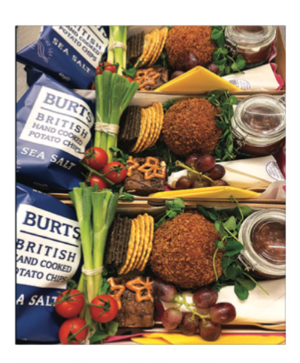
Ploughman's Lunches £16