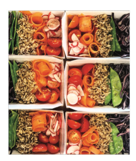
Salad Boxes £11.50