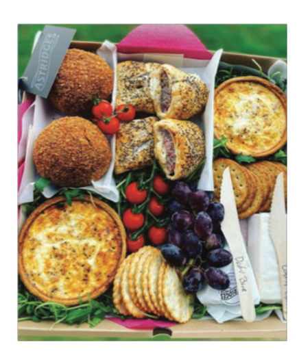
Savoury Boxes £50