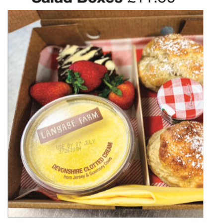
Cream Tea £8.50