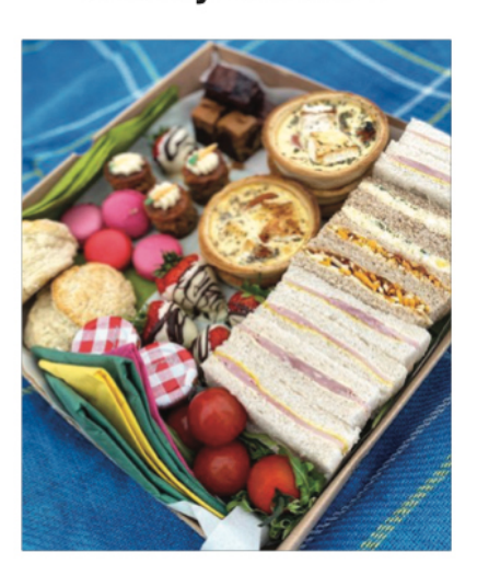
Afternoon Tea £35 Delivery Exeter area only. Please order 48 hours in advance as all food is freshly prepared.