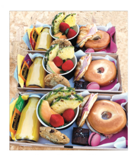
Brunch Box £15

We are happy to cater for any diatary requirements Please let us know