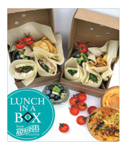
Lunch in Box £11.50